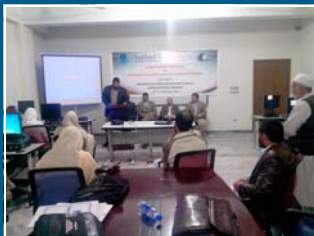
During the Workshop

PLWO & of Sarhad University of Science and information Technology Peshawar