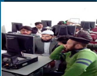
Workshop Practice Session

Pakistan Librarians Welfare Organization KPK Chapter along with the collaboration of Sarhad University of Science and information Technology Peshawar has successfully organized 2-days practical workshop on Library and information services software packages on 10-11 February 2014. WinISIS, Caliper and Koha library software packages were briefly taught by the resources persons.